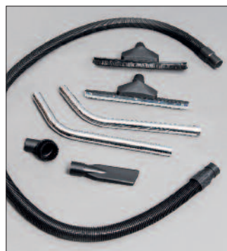
for WS 100