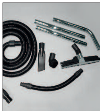
for WS 200