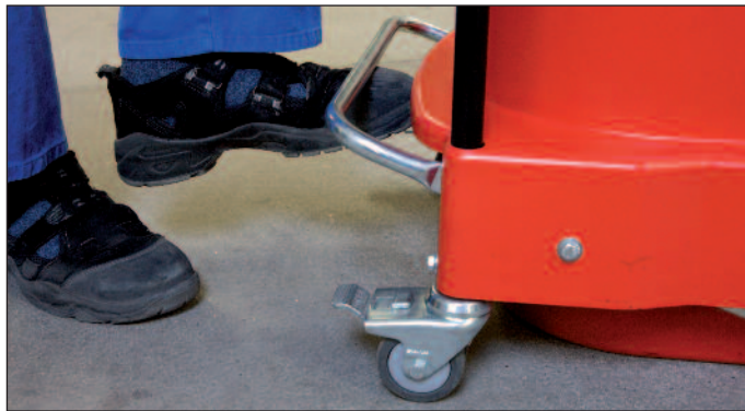
Emptying using foot pedal