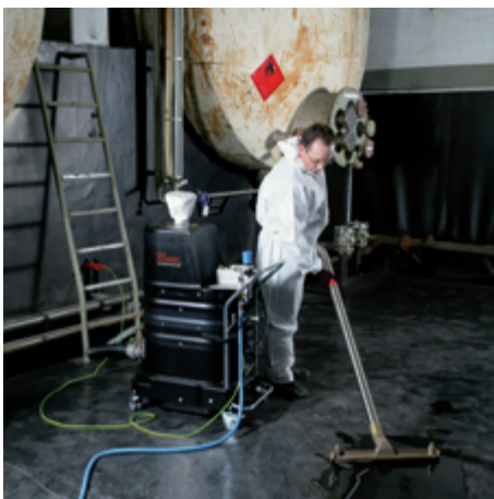
R01 P022 in explosive gas areas