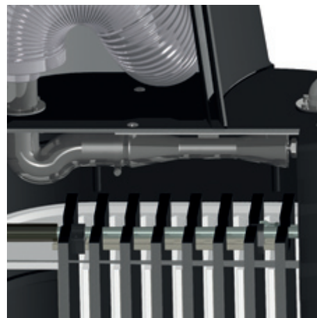
Powerful, robust Venturi nozzle